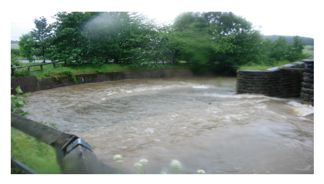
Figure 2 - Flow down 1943 spillway and original south spillway during the incident. Original south spillway is on extreme right of photograph.

The hydraulics at the south end of the dam are complicated with water entering two spillways at different levels, in one case round a sharp rightangled bend.