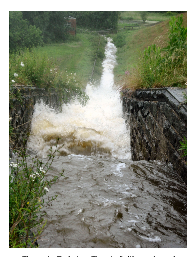
Figure 4 - Turbulent Flow in Spillway channel

• overtopping of the chute walls eroding fill behind the walls as well as, perhaps, causing some backpressure on them.