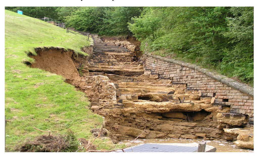
Figure 7 - Damaged spillway at Boltby in 2005

The incident at Boltby in June 2005 and the Ulley incident both point to a need for research into the hydraulic conditions that can be withstood by masonry walls of various types. Superficially the masonry walls beside the southern bywash spillway at Ulley appeared to be in reasonable condition. However, events showed that they were unable to withstand the hydraulic conditions to which they were exposed.