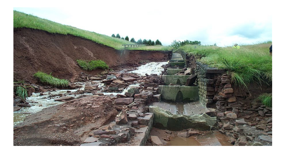
Figure 3 - Scour hole photographed on Tuesday 26 June, 2007

The above figures show that the peak flow in the incident was only about 14 % of the PMF and 38 % of the 10,000 year outflow.