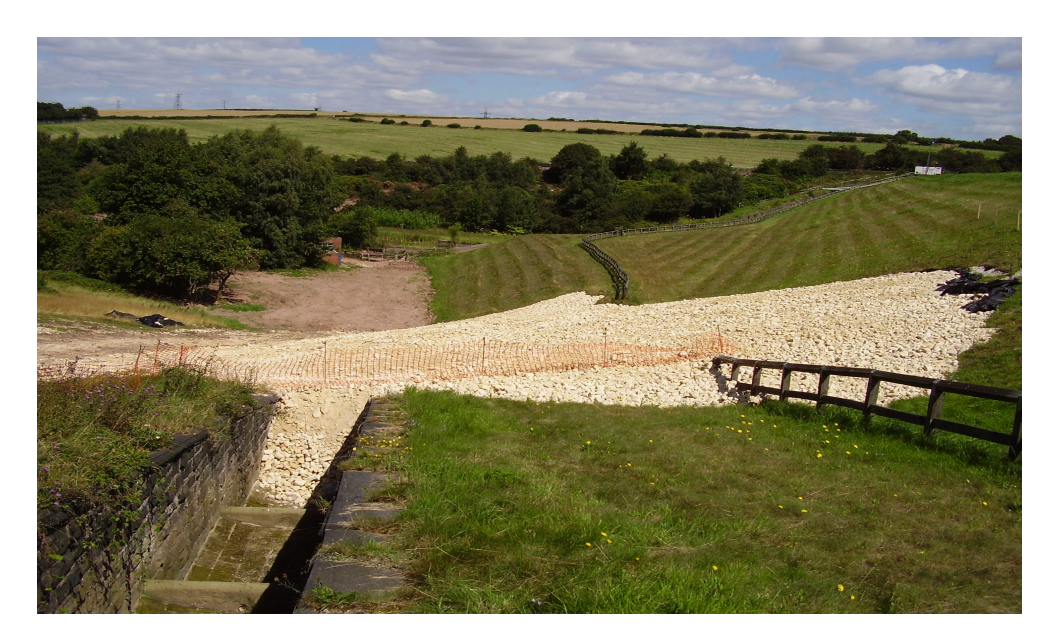
Figure 6 - Repaired scour hole after incident

Gold (Strategic) Command sits above this and operates at county level, monitoring crises in different areas, adjudicating the relative seriousness of conflicting requirements and deciding strategically on orders of precedence in terms of response. For a number of reasons, the resources needed to mitigate the potential failure of Ulley reservoir were given precedence by Gold Command over other flooding elsewhere in Rotherham.